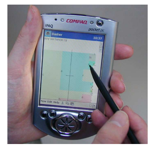
Figure 2. Dasher can be driven by eyetracker or by pointing on a touchscreen, as well as with a regular mouse.